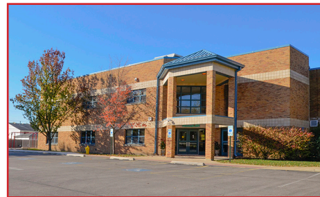
Queen Bee School Dist. Additions/Renovations