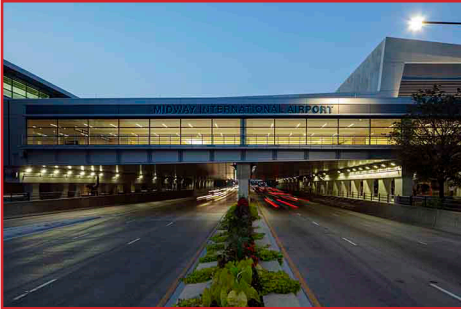
Midway Security Checkpoint Expansion