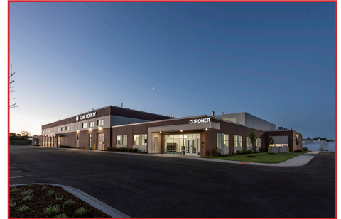
Kane County Multi-Use Facility