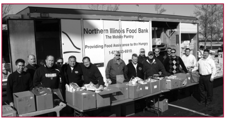
Members of the DuPage County Building Trades and IBEW Local #701 packed food items for needy families at the February 29 Mobile Food Pantry event.

Approximately 350 families were the beneficiaries of the combined efforts of the Plumbers & Pipefitters Local #501, IBEW Local #701 and the DuPage County Building Trades as their sponsored Mobile Food Pantry events were extremely successful in assisting needy individuals in the area. Both local unions partnered with the Aurora Area Interfaith Mobile Food Pantry as a truck from the Northern Illinois Food Bank arrived at the premises of Local 501 in Aurora on March 22 and at the DuPage County Building Trades on February 29 at IBEW Local 701 in Warrenville.