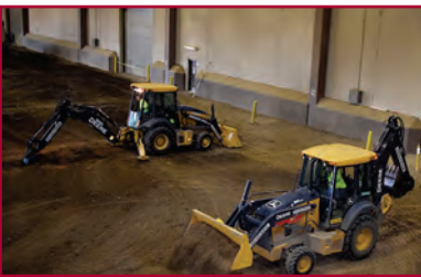
Apprentices operate backhoe equipment at the Training Center.

With the April 30th webinar in the books, which featured the Operating Engineers Local 150's Training Center in Wilmington, CISCO and its partner - The Chicago Transit Authority - have now completed seven virtual tours of building trades'