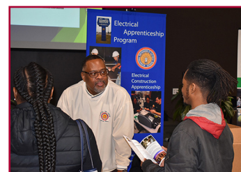
IBEW Local 134.