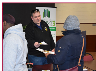
Operating Engineers 150.