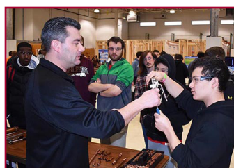
Pipefitters Local 597.