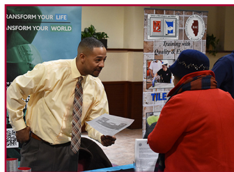
Heat & Frost Local 17.