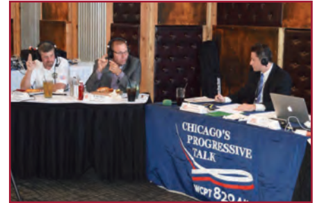
Elected officials and labor leaders cut the ribbon on the Renewable Energy Field at the IBEW training facility in Alsip (left). DuPage County and Tollway Board members announced the opening of the I-390 ramp (center), part of the Western Access highway project. Labor's voice was heard loud and clear as WCPT-820AM radio hosted a live broadcast on current issues in Illinois politics (right).