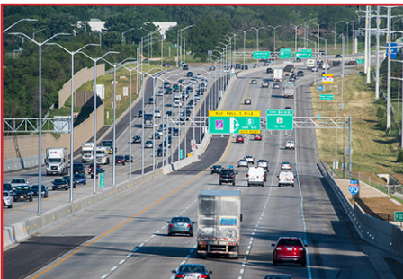
Jane Addams Tollway (I-90) Reconstruction