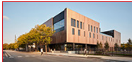
Plumbers Local 130 JAC Training Center